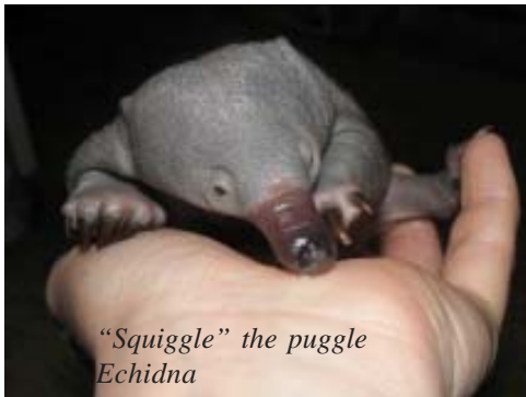
"Squiggle" the puggle Echidna