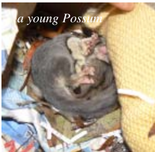
a young Possum

mostly the eastern brown variety so far. Several cases have involved some very determined patience as heads pop out from winter spots for some warmth. Two mating sites have meant a