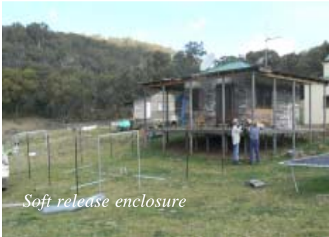
Soft release enclosure