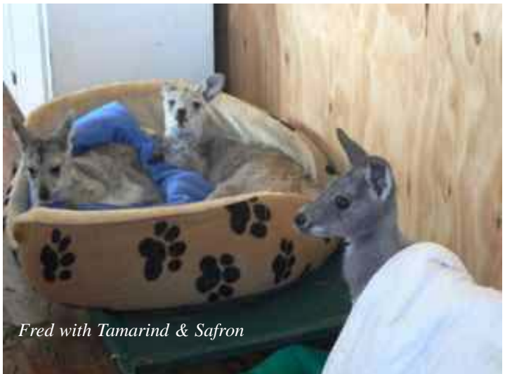
Fred with Tamarind & Saffron

With the splint and the bandages on, Fred's foot was quite large and awkward for him to move. After some practice, he was able to hop around quite well but sometimes got caught on the way. The splint had to stay on for 6 – 8 weeks but on 3 August it was removed. An xray or two later, showed that the bone had set well, and while not perfectly straight, it was near