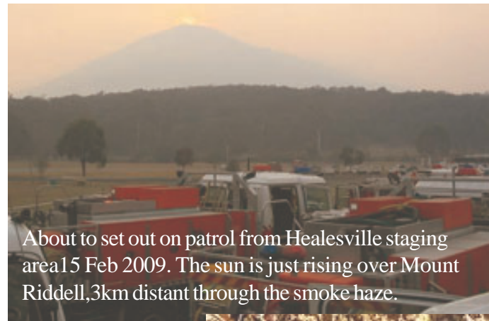
About to set out on patrol from Healesville staging area 15 Feb 2009. The sun is just rising over Mount Riddell, 3km distant through the smoke haze.

a tied plastic garbage bag and placed in the back of the Ute. Her husband caught the snake and put it there himself. I politely asked why her husband could not then carefully remove the bag containing the snake. "He's in hospital!" the woman replied. Yep. He got bitten twice as he