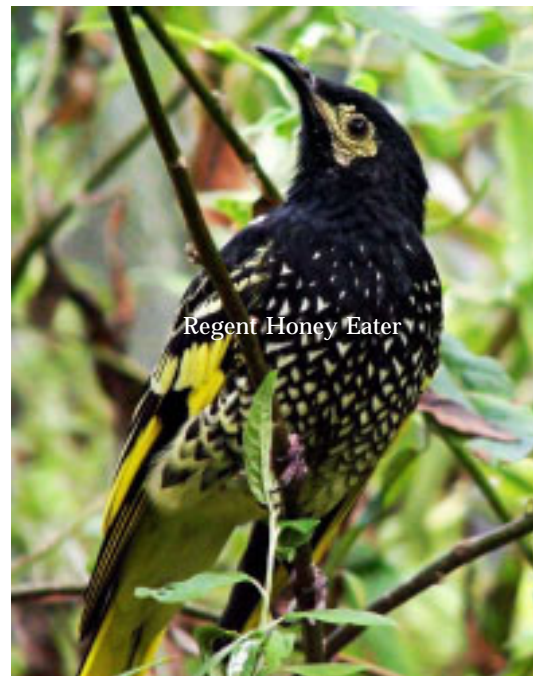
Regent Honey Eater