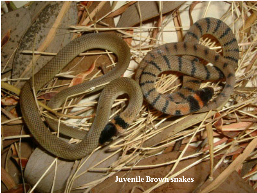
Juvenile Brown snakes

Not sure that I heard correctly, I checked and yes the snake was inside