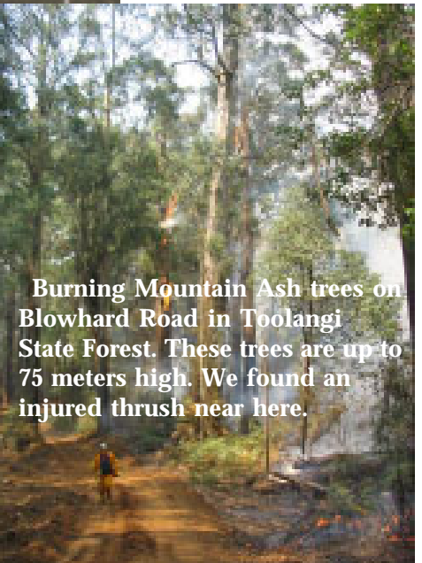
Burning Mountain Ash trees on Blowhard Road in Toolangi State Forest. These trees are up to 75 meters high. We found an injured thrush near here.

covered the area of Yarra Glen, Healesville, Toolangi State forest (near the devastated towns of Kinglake