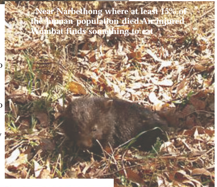
Near Narbethong where at least 15% of the human population died. An injured Wombat finds something to eat

seemed to be in a state of shock, nevertheless they were overjoyed that the RFS had come to help. Our task was to relieve the Victorian CFA crews, mop up remnants of the fire, put in control lines to prevent further outbreaks and be on standby for property protection if the fire broke out of the control lines.