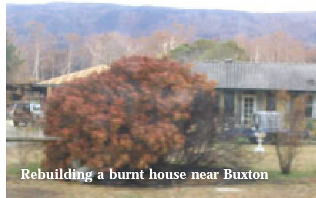
Rebuilding a burnt house near Buxton

The first week the forests were silent and virtually no wildlife was seen. However, by the second week we began to see wombats, possums, Eastern Grey kangaroos, wallabies and thousands of rabbits! We rescued a thrush that