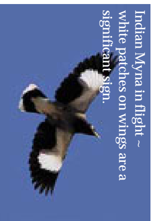
Indian Myna in flight ~ white patches on wings are a significant sign.

scraps near picnic areas and rubbish bins. They will also take pet food and bird seed from backyards in residential areas. In rural areas they feed on stock feed, grain, pellets and compost. They foul on the backs of