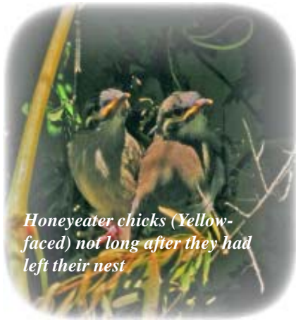
Honeyeater chicks (Yellow-faced) not long after they had left their nest

keep the Goshawk couple away. These Brown Goshawks nest in a large tree on the hill behind the house.