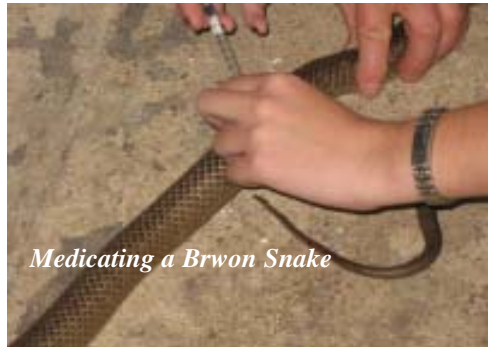
Medicating a Brown Snake

Yet another interesting call has been the removal of a large Eastern Brown Snake from under an invalid pensioner's recliner chair on Gostwyck Road, complete with pensioner! Although it's a good twenty