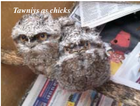
Tawniys as chicks

The Tawny Frogmouth was first described in 1801 by English naturalist John Latham. Its specific