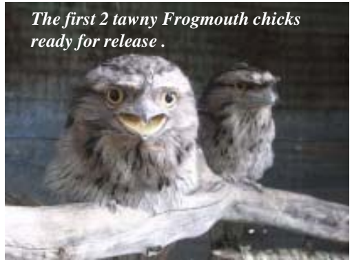
The first 2 tawny Frogmouth chicks ready for release .

and southern New Guinea. The Tawny Frogmouth is often thought to be an owl. Many Australians incorrectly refer to the Tawny Frogmouth by the colloquial names of "Mopoke" or "Morepork", however, these are actually common alternative names for the Southern Boobook Owl. Frogmouths are not raptorial birds.