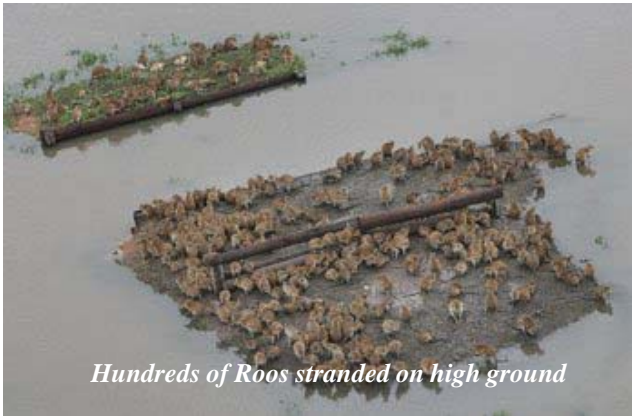
Hundreds of Roos stranded on high ground

www.uq.edu.au/news/index.html?article=22455 "In an effort to eliminate the global burden of dengue fever, an Australian-led international