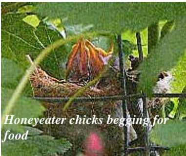
Honeyeater chicks begging for food

The next exciting thing I saw were two tiny balls of grey fluff huddled together which only showed signs of life when one of their parents returned with a minute insect. Then, they