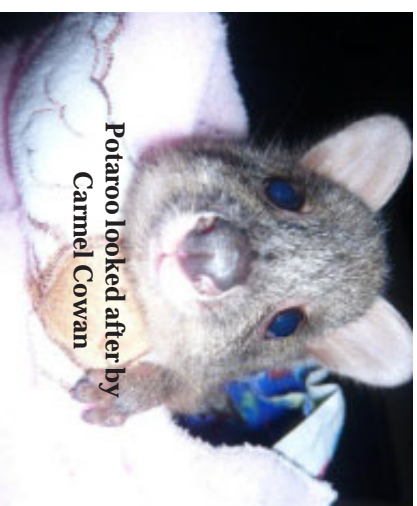
Potaroo looked after by Carmel Cowan

Dr Friend said: 'The condition of the animals was good and 12 of the 19 females captured were