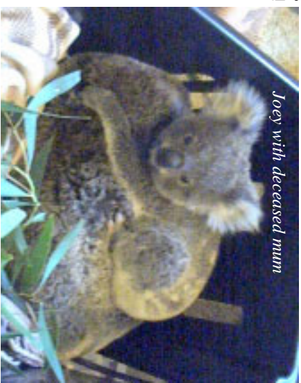
Joey with deceased mum

lots of ring-a-ring-a-rosey around the tree trunk and hissing and